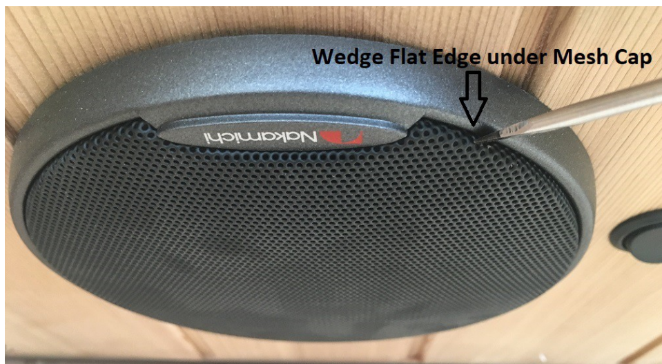
How To Change a Speaker