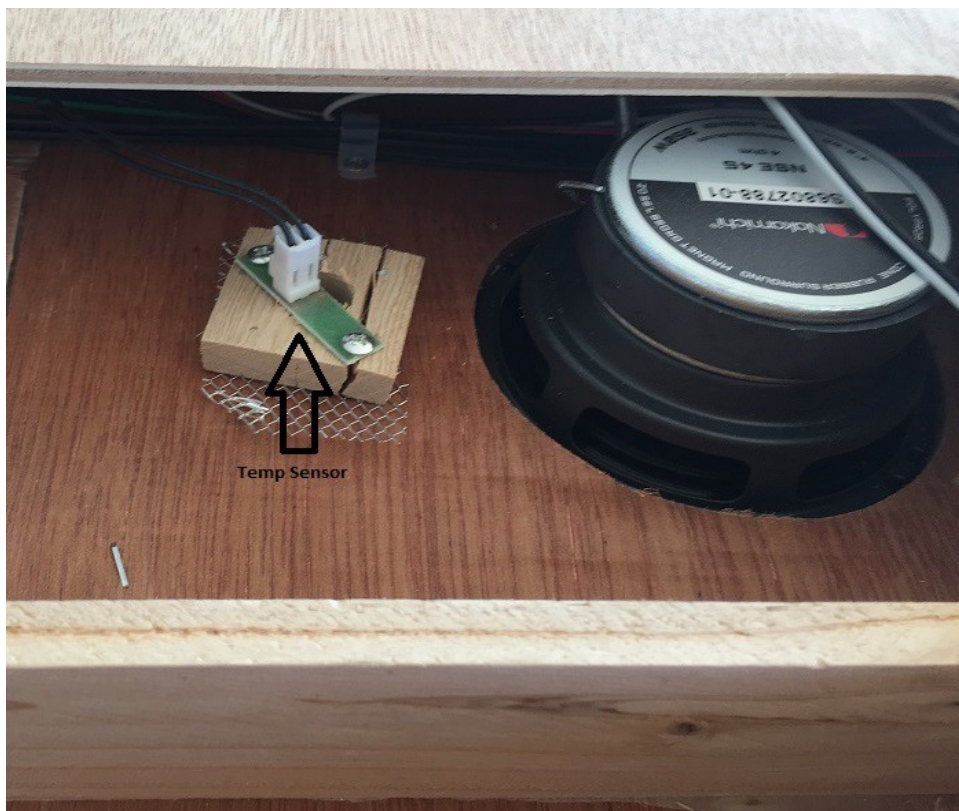
How To Change a Temperature Sensor