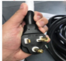
Plug: NEMA 5-30p