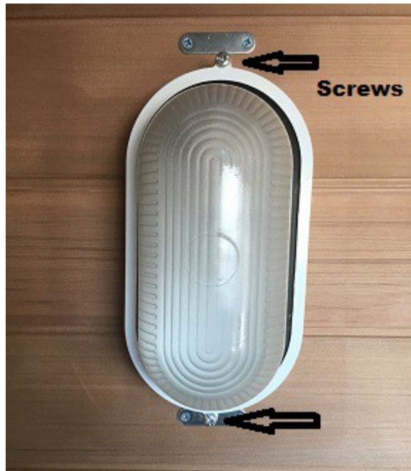
How To Change a Sauna Wall Fixture