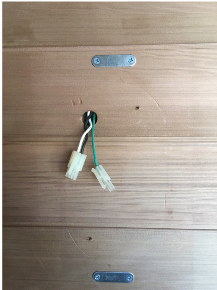
How To Change a Sauna Wall Fixture