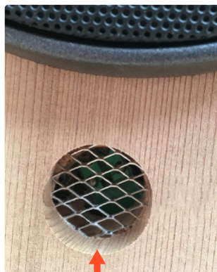
Temp Sensor Ceiling Hole

The Temp Sensor can be found on the power cord side of the Sauna. The Temp Sensor is small, on top of small wood block with mesh usually next to a speaker.